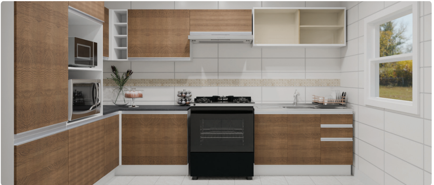
4k kitchen render from the retailer's 3D Cloud Kitchen Planner