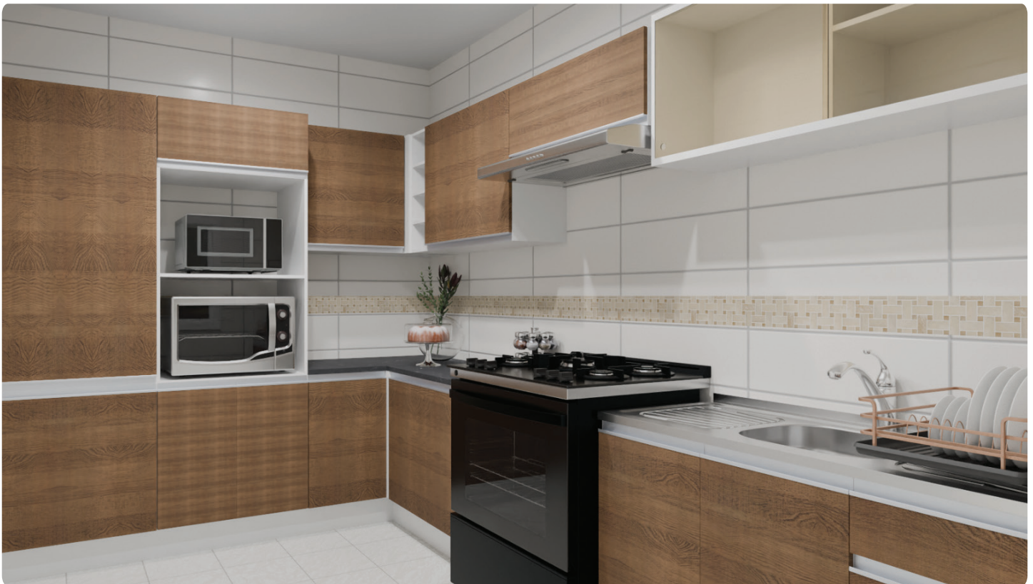
4k kitchen render from the retailer's 3D Cloud Room Planner

With more customers expecting digital-first planning options, the business knew it needed to invest in an enterprise-ready solution that was more nimble and faster to learn, could support growth, reduce friction, and provide realistic visuals that made the kitchen buying journey more tangible and emotional.