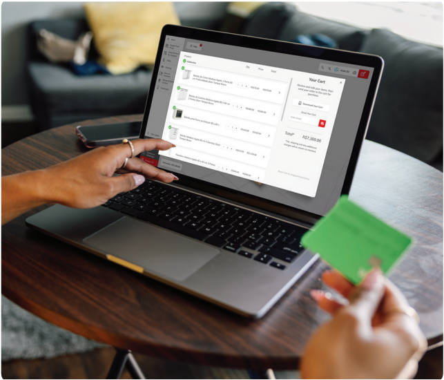
Viewing the cart and checking out with the 3D Cloud Kitchen Planner